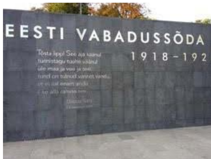
Fig 4.4 - The name and the years of the War of Independence and the poem on the wall behind the Victory Column. Picture taken 7.10.2015

Raise the flag! In this turn of time / witness the winds twist / over the land and water and road: / hour has come to swear an oath / that never again will bow down / under a yoke this nation.