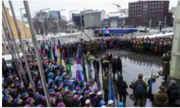
Fig. 4.5 – Laying of wreaths in front of the Victory Column during the celebrations of the Independence Day, 24 February 2015.

Regarding the gap between the intended purpose of the Victory Column and its plastic and figurative levels, the memorial celebrates an event that, according to Estonian historical narratives, is linked with ideals of freedom and sovereignty. However, design choices such as hermetic iconography, large size and elevated location have linked the Victory Column with powerful messages and totalitarian aesthetics .