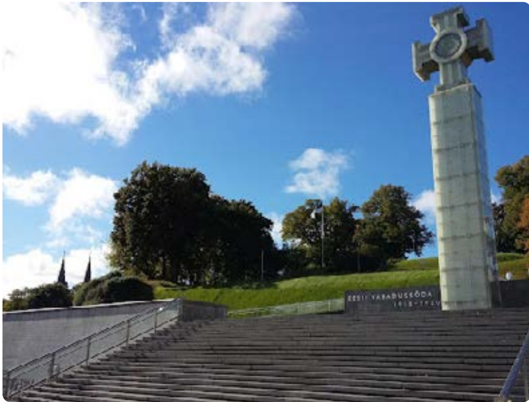
Fig. 4.1 – The War of Independence Victory Column. Picture taken 5.10.2015

This lecture engages with the theoretical and methodological framework outlined in Lecture 2 and 3, presenting an analysis of the multiple interpretations of the War of Independence Victory Column (fig. 1), a war memorial unveiled in Tallinn in June 2009.