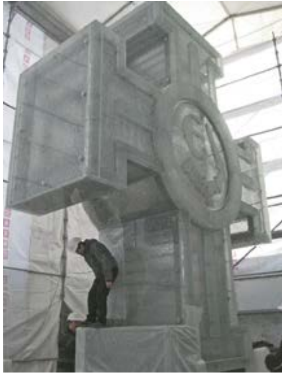
Fig. 4.3 – The Cross of Liberty at the top of the Victory Column during the constructions. Picture from Pihlak et al. 2009: 120.

Behind the Victory Column, there is a wall dividing the area of the memorial from a green area. On this wall, there are writings in silver letters including the name of the commemorated war ('Eesti Vabadussõda' –Estonian War of Independence, fig. 5), the years of the War of Independence ('1918-1920', fig. 5) and part of a poem written by the Estonian neo-Romantic poet Gustav Suits in 1919 (fig. 6):