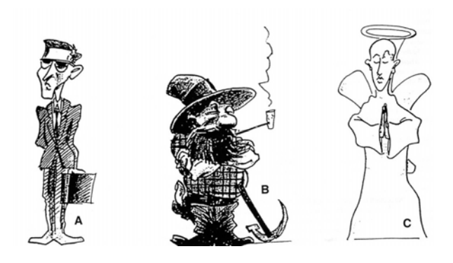
Figure 2. The Three Cultural Heroes, drawn by Christian Brunner.

Put the two dimensions together, group and regulation, you get four opposed and incompatible types of social control, and plenty of scope for mixing, modifying or shifting in between the extremes.