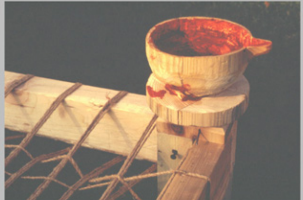
"Charpaiya" (bed), 1987, 25' x 3' x 5.' Outdoor installation (wood, fabric, rope made of jute, turmeric, vermillion)